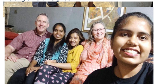
Connecting with youth in Dhaka

Follow our blog: AsTheRobbinsFly.wordpress.com