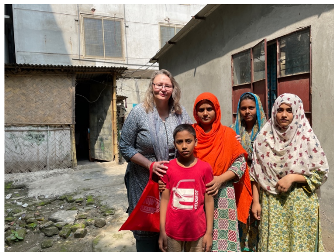
Visiting a widow and the fatherless