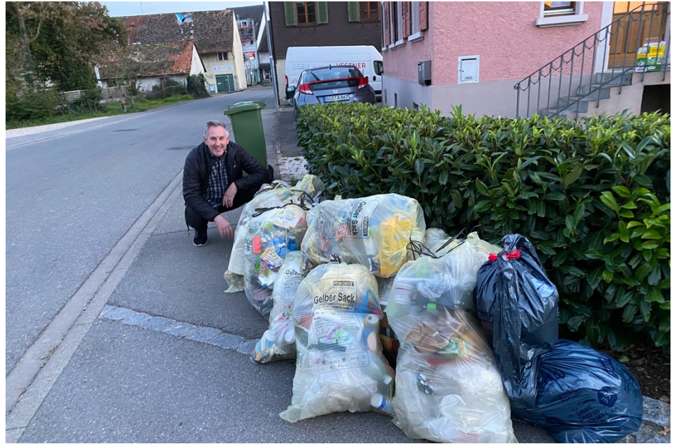
The light bags are recycle and black bags are trash. We are serious about our recycle in Switzerland.