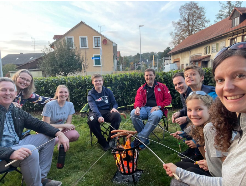
Fellowship with new neighbors