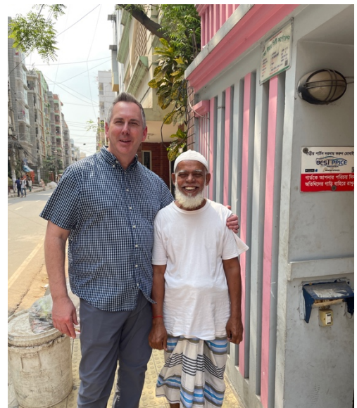
Visiting an old neighbor