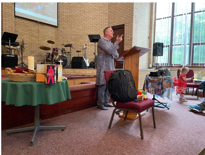
Speaking in the United Kingdom