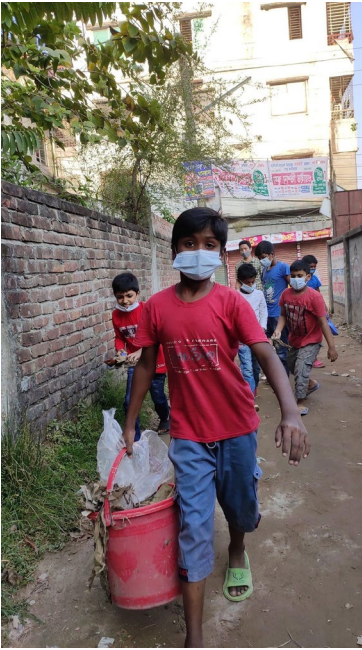
Trash clean-up in Dhaka